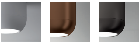
BC Wrinkled white